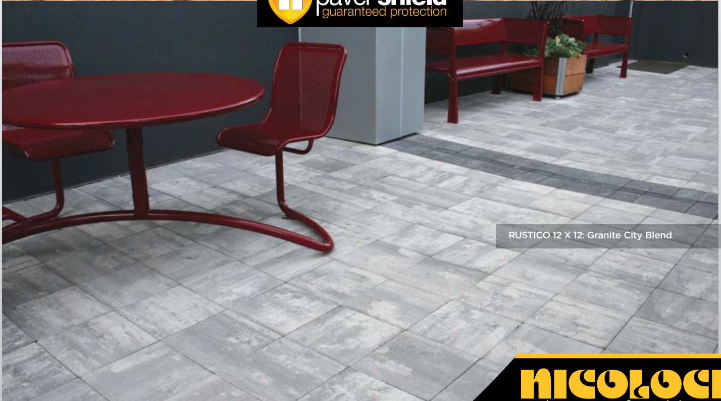
RUSTICO 12 X 12: Granite City Blend