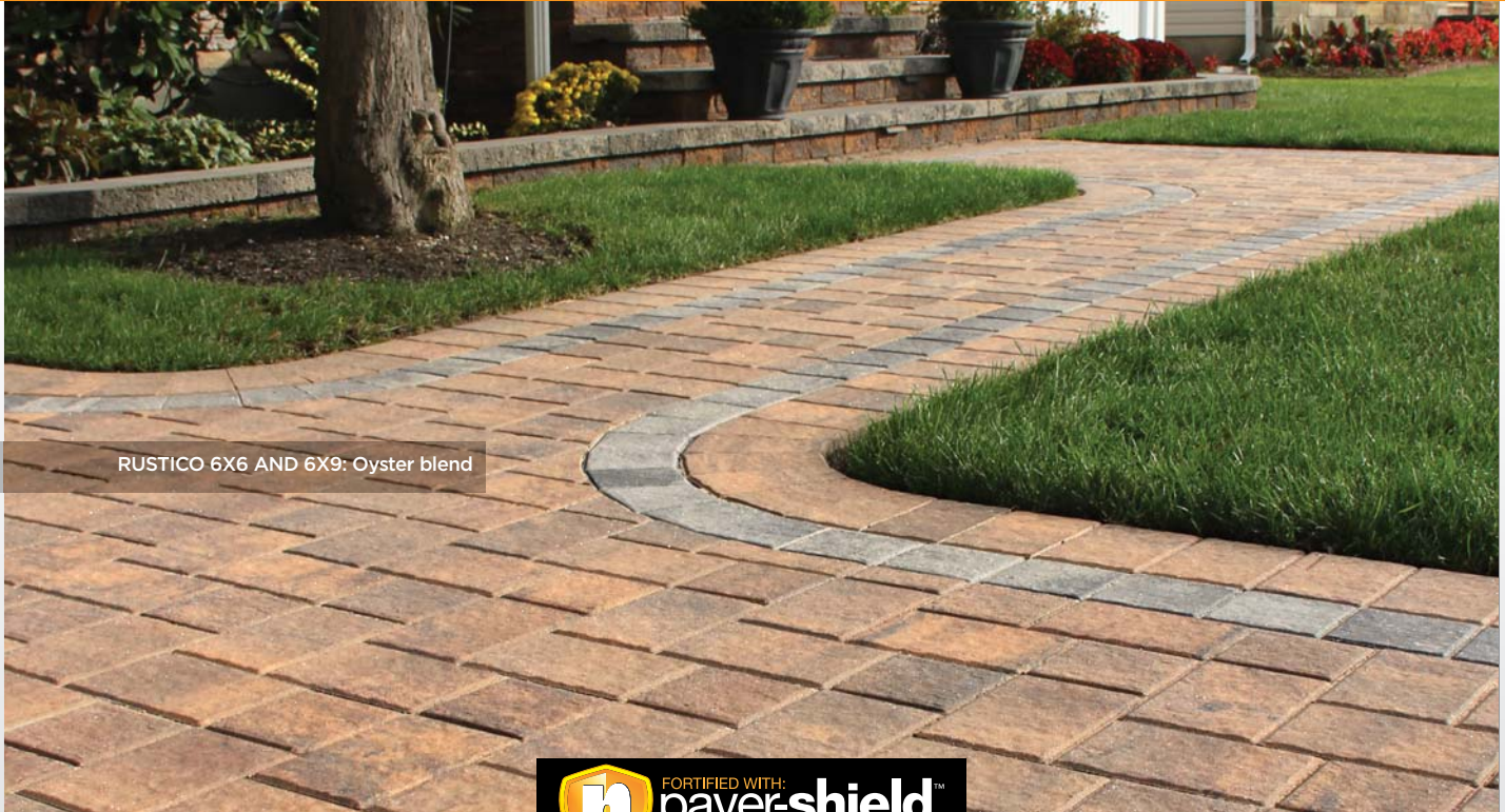
RUSTICO 6X6 AND 6X9: Oyster blend