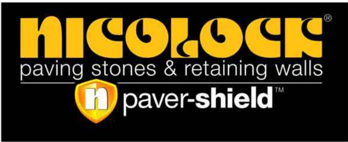
Nicolock Design Kit #3 Scale: 1/8" = 1'