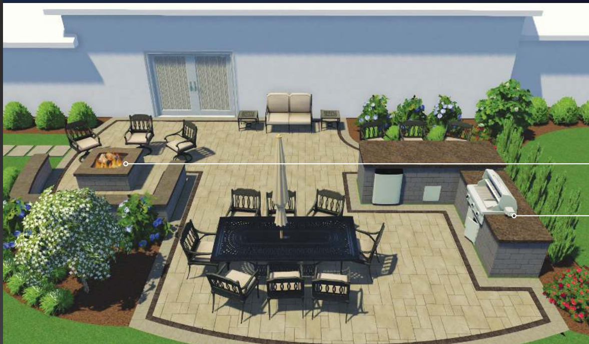
Verona Firepit Kit