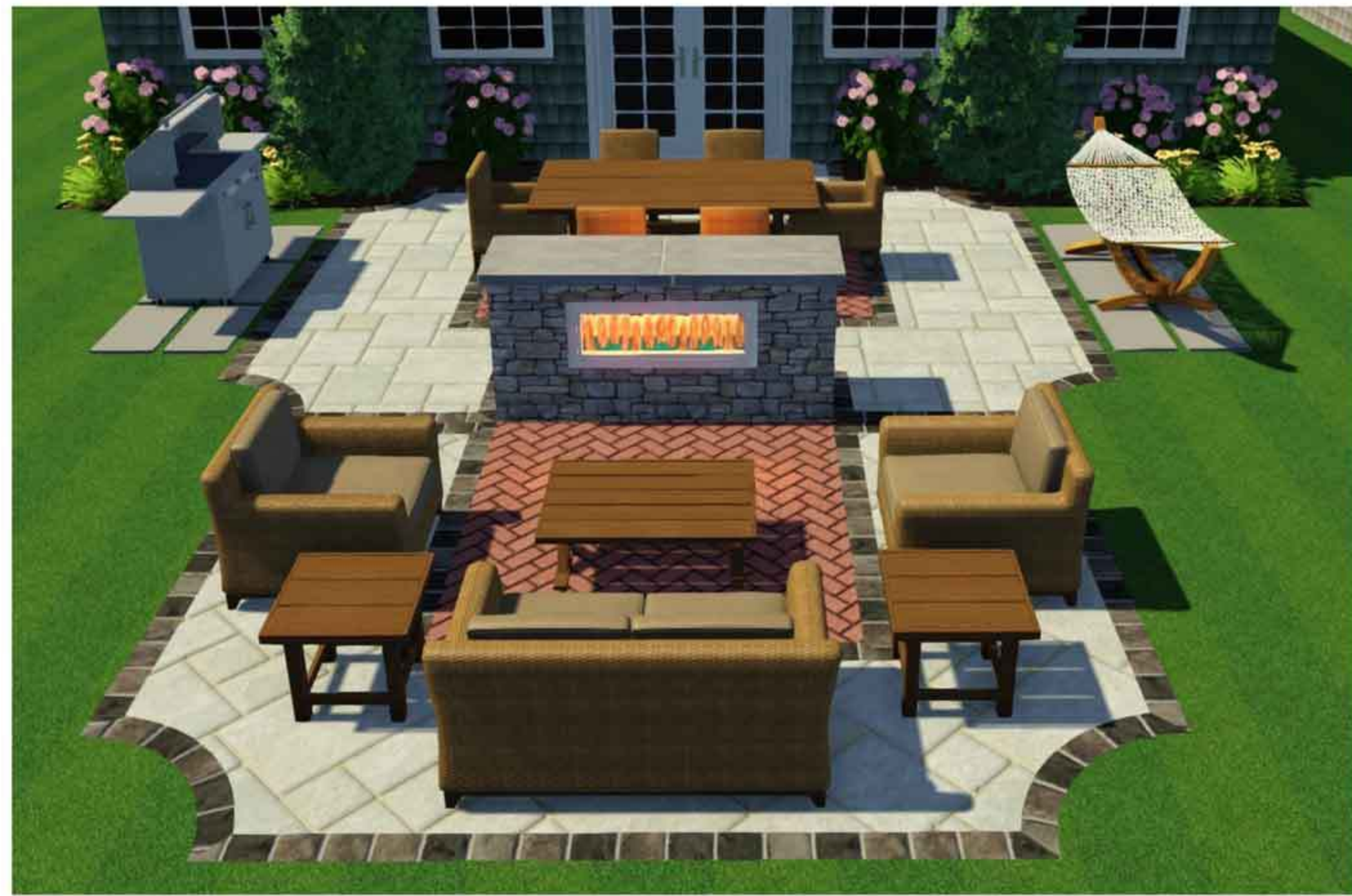
Nicolock Design Kit #4 Scale: 1/8" = 1'