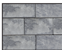
GRANITE CITY BLEND