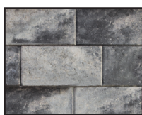
GRAPHITE PEARL BLEND*