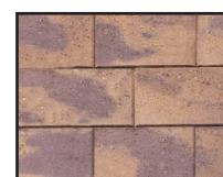
GOLDEN BROWN BLEND