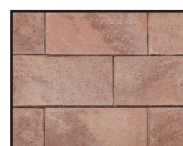
CRAB ORCHARD BLEND