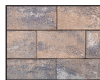
SOUTH BAY BLEND