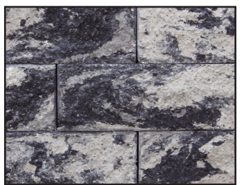
GRAPHITE PEARL BLEND*