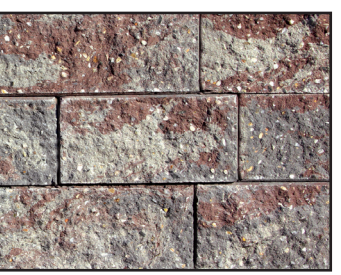
HUDSON VALLEY BLEND