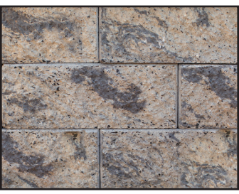
GRANITE CITY BLEND