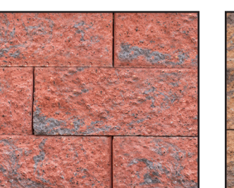
FIRE ISLAND BLEND