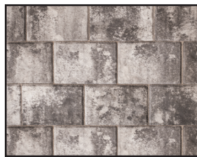
GRAPHITE PEARL BLEND*