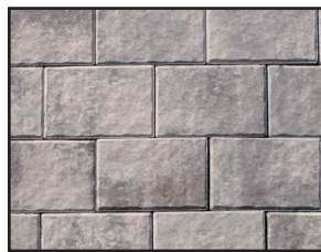
GRANITE CITY BLEND